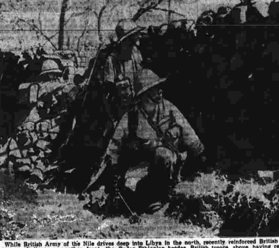
While British Army of the Nile drives deep into Libya in the north, recently reinforced British units have recaptured an important frontier post, British troops, above, having taken Fort Gallabat on the frontier, watch alertly for the enemy—only 300 yards away.

Modern Menus Fish and Beans Combined To Make Heavy Dinner By Mrs. Gaynor Maddox, NEA Service Staff Writer Fish is an economy protein. Combine it with a nutritious and delicately flavored sauce and you have still more economy for the main protein dish.