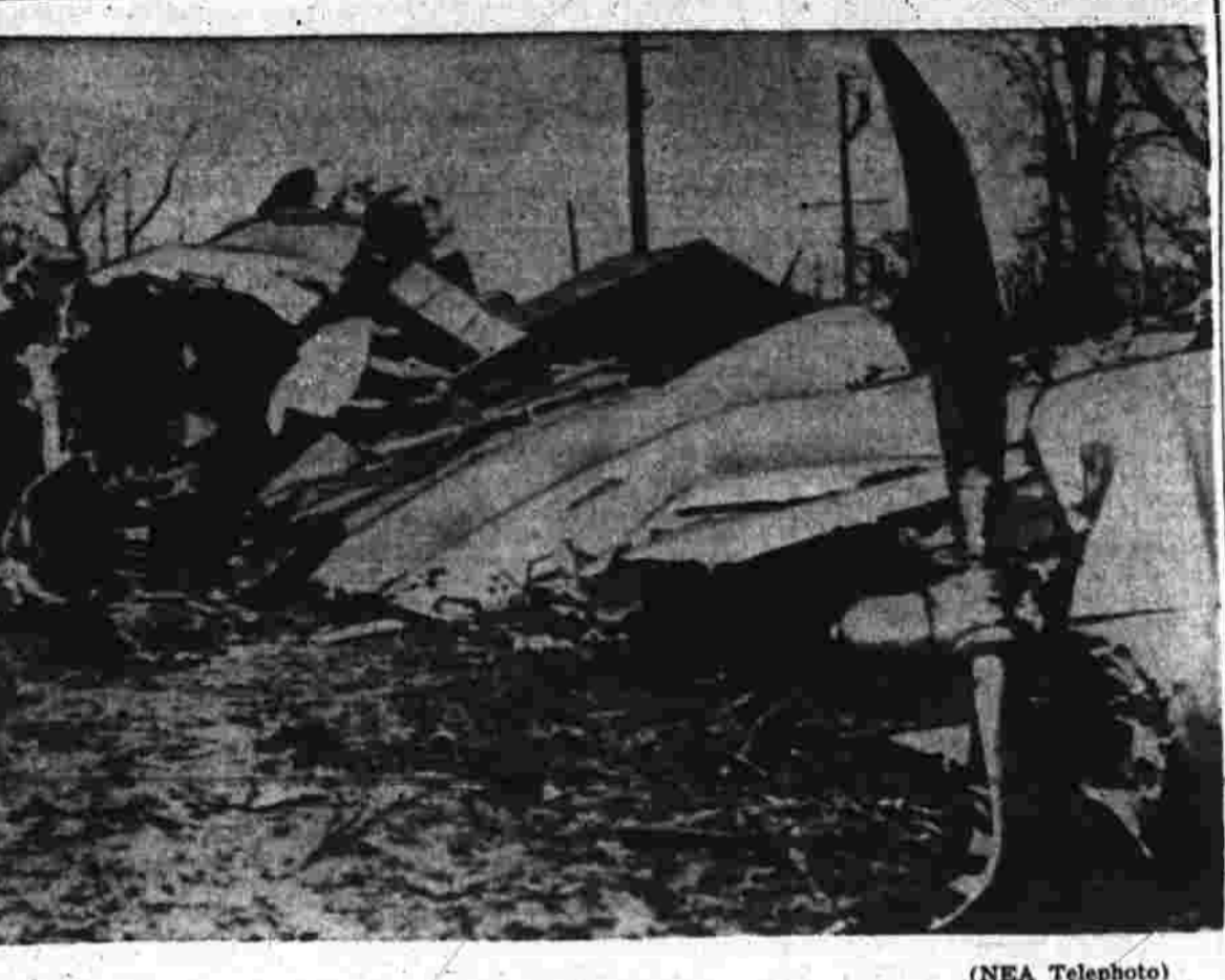
When a low-flying TWA sleeper plane, bound for New York, hit a high tension wire near Lambert Field, St. Louis, recently, it crashed and burst into flames. The pilot, Capt. P. T. W. Scott, 37, of New York, and a passenger were killed. Plane was badly damaged, but 10 passengers, although injured, miraculously survived crash. Plane broke in two, with passenger compartment (upper left in photo of wreck), remaining intact.